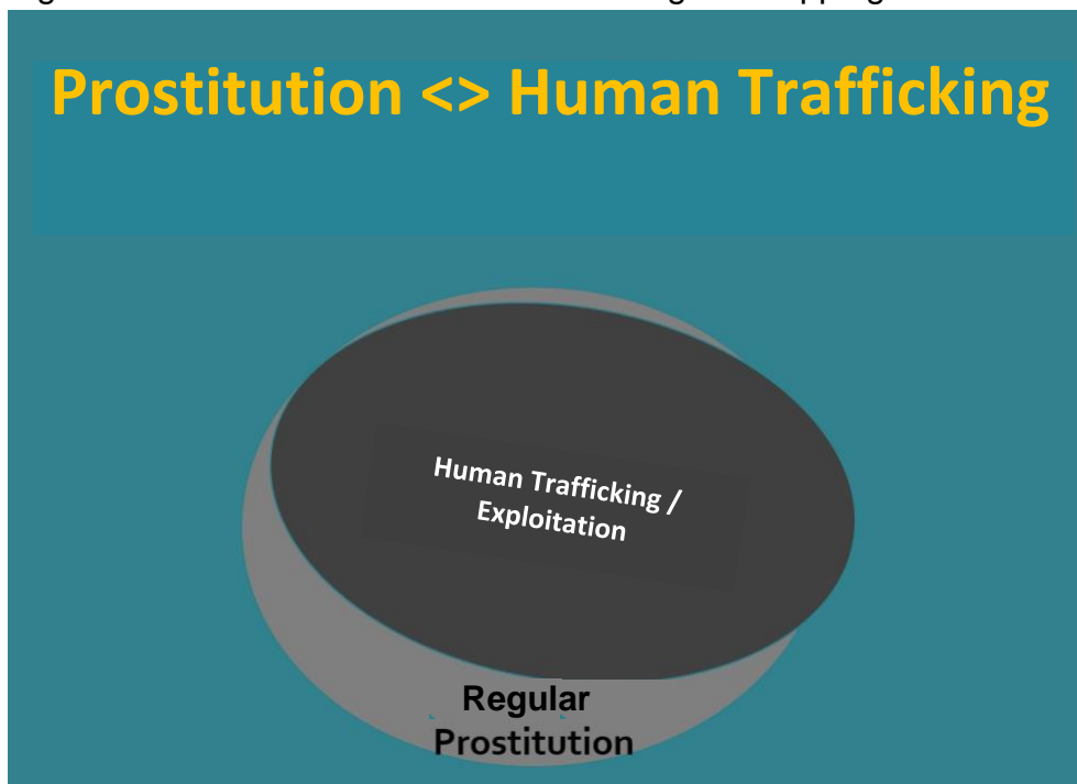
Figure 3 Prostitution and Human Trafficking Overlapping