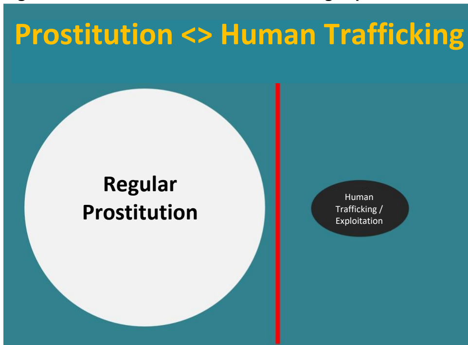
Figure 2: Prostitution and Human Trafficking separated

pimping, etc. are primarily committed in regular, commonly known prostitution locations, i.e. where the victim types are active. This is also documented in the BKA situation report on human trafficking (see section 5.3).